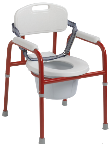
Item # PC 1000 RD Shown